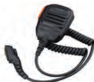
Remote Speaker Microphone (IP57) SM18N2