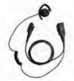
Earset Swivel EHN17