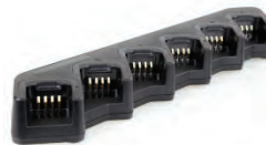
MCU Multi-Unit Charger (For Thick Battery) MCA08