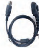
Programming Cable (USB Port) PC38