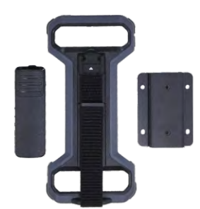
POA207 Protective Case with Hand Strap BRK37 Protective Case with Mounting Bracket BC39 Belt clip for use with POA207