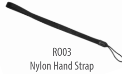
R003 Nylon Hand Strap