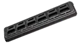
MCL35-S Multi-Unit Charger for Radios and Batteries