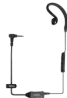
EHS30 Earpiece with in-line PTT & C-Earset