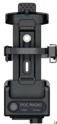
WIRED ACCESSORIES FOR THE CK10 CARKIT

The CK10 Car Kit is a rugged vehicle mounting assembly that enables the PNC380S to be installed on a vehicle dashboard and comply with DOT requirements. The Car Kit allows the PNC380S to be easily removed for handheld job-site communications. The Car Kit includes a locking bracket, an on/off power button, and ports for external speakers, microphones, and push-to-talk buttons. The CARKIT also functions as a docking charger for the PNC380S.