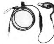
EHS24 C-Style 3.5mm Earpiece with Mic and PTT button